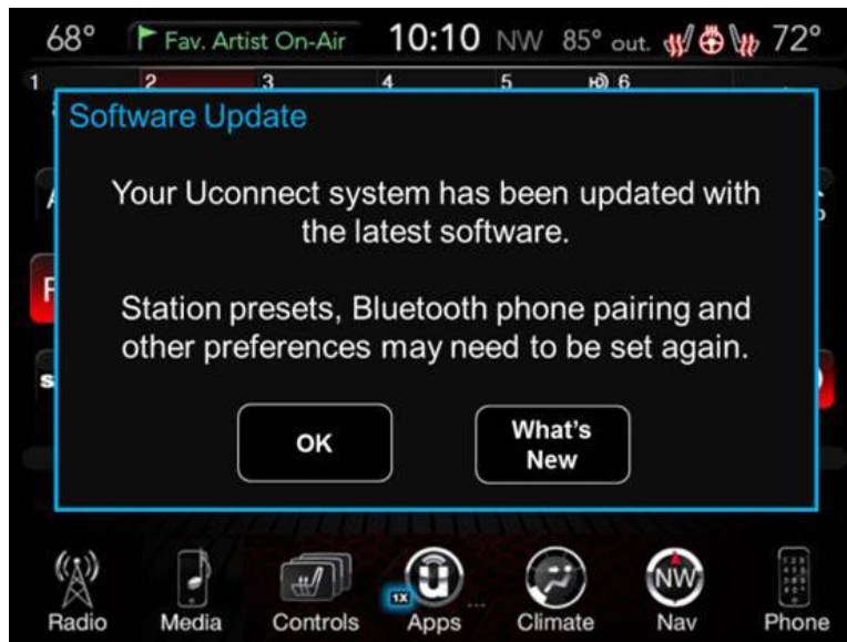
Fig. 4 Update Confirmation Screen