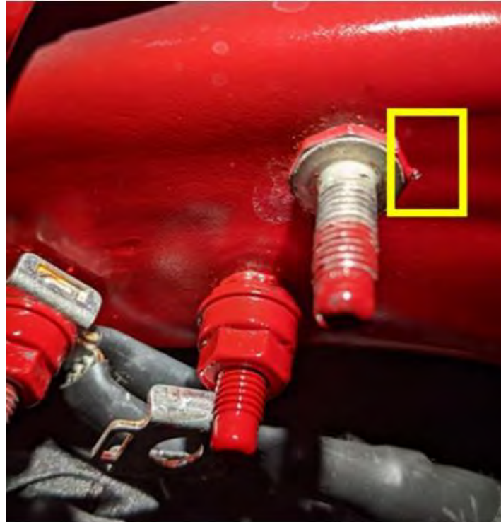
Fig 3. Weld slag to be filed or ground down.

Using a multimeter verify power and ground at the EHPS C1 connector. C2 connector has pins for CAN communication and Ignition Run Start. Inspect each for problems including pin pushout and harness routing. Repair as needed.