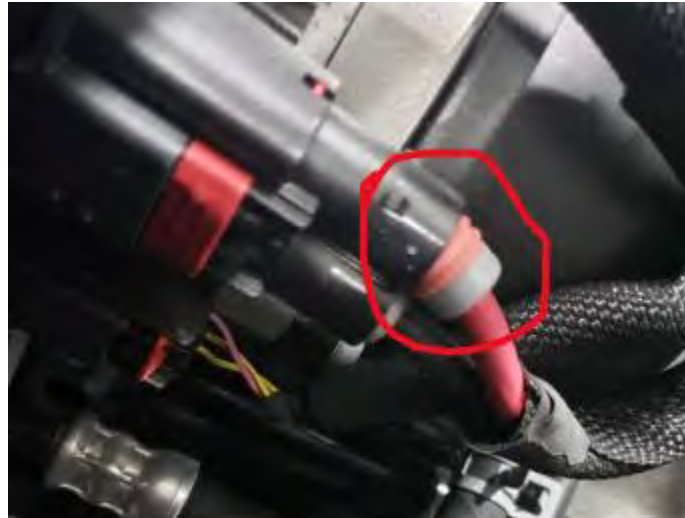
Example Of Pin Push Out.

Testing of the CAN circuits can be performed using a multimeter, but an oscilloscope pattern is best using the MOPAR Pico Scope. Multimeter voltage for Can C+ approx 2.6V and Can C- 2.4V.